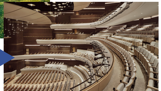
Buddy Holly Hall's main theater, consisting of a four-level, 2,297-seat capacity with two VIP lounges.