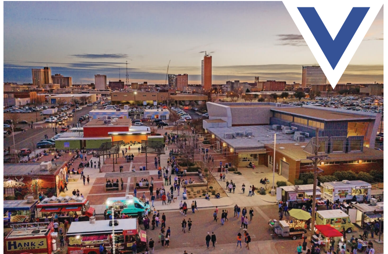
Never a dull moment, especially during the First Friday night art trail event each month downtown.

While Lubbock is the 11th largest city in Texas, there's no denying that good ol' hometown feel. The people are friendly the way only hometown people can be. It's hard to put a price on that.