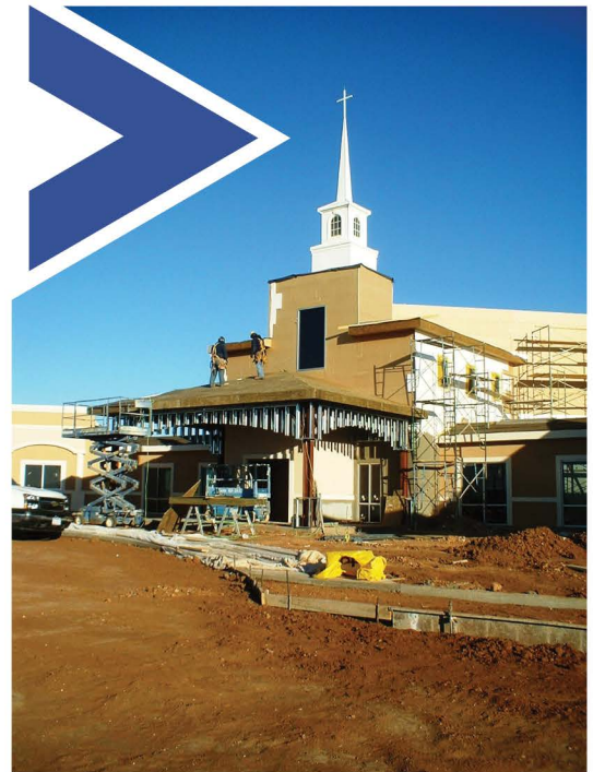
This photo shows the construction of the church building mid-2008. We've come a long way since then!

Today, First Presbyterian is proud to stand as a beacon of love and acceptance, opening its doors to all who seek solace, spiritual guidance, or simply a sense of belonging.