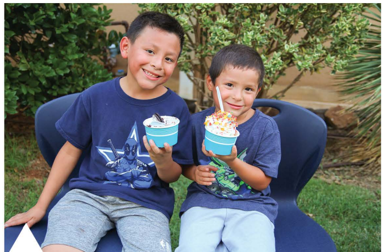
We engaged the community this summer by hosting a "Family Movie Nights" week. Food trucks camped out in the parking lot as each night we held a special screening of "The Chosen".