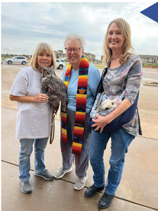
In late 2022, we held a blessing of the animals service and met all kinds of creatures, including an owl and opossum.

Today, First Presbyterian is proud to stand as a beacon of love and acceptance, opening its doors to all who seek solace, spiritual guidance, or simply a sense of belonging.